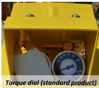
Torque dial (standard product)